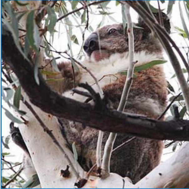
One of the koalas south of Bredbo where koalas have been observed chewing on brittlegum trees.